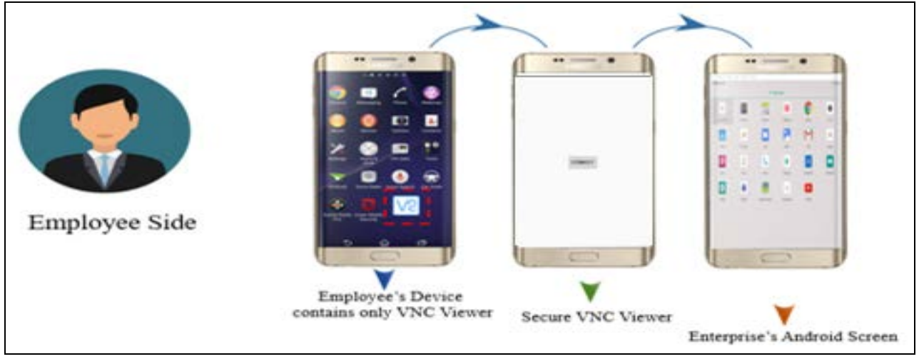
Figure 2 Employee Side